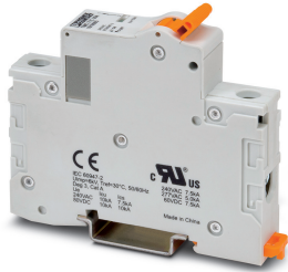
Thermomagnetic circuit breaker

Please be informed that the data shown in this PDF Document is generated from our Online Catalog. Please find the complete data in the user's documentation. Our General Terms of Use for Downloads are valid ( http://phoenixcontact.com/download )